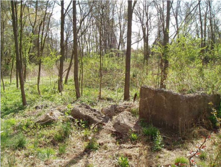
Photograph 4: Looking northeast at old, scattered debris observed on the property.