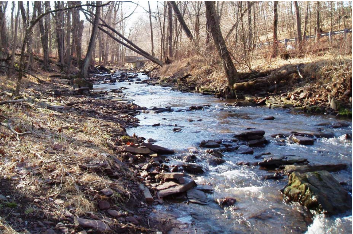
Preserved section of Houghs Creek