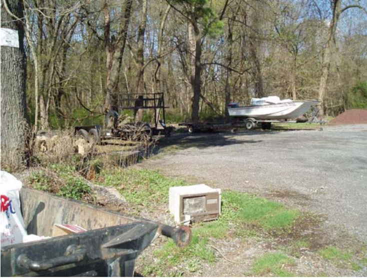
Photograph 1: Looking northwest at the southern portion of the stone parking/storage area along General Hamilton Road.

(See the enclosed Orthophoto Map showing the approximate location and direction of the photographs below)