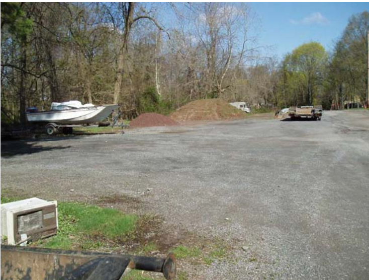
Photograph 2: Looking north northwest at the stone parking/storage area along General Hamilton Road.