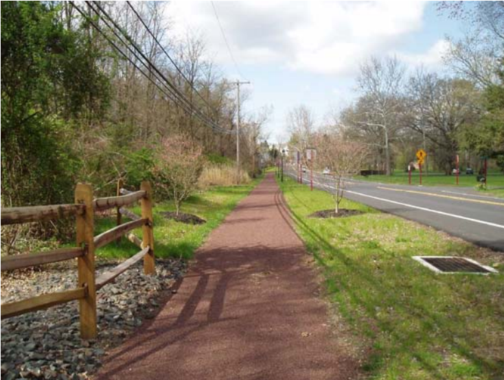
Photograph 7: Looking southwest from the new sidewalk along Washington Crossing Road at the same stormwater drainage grate and improved area around depicted in Photograph 6.