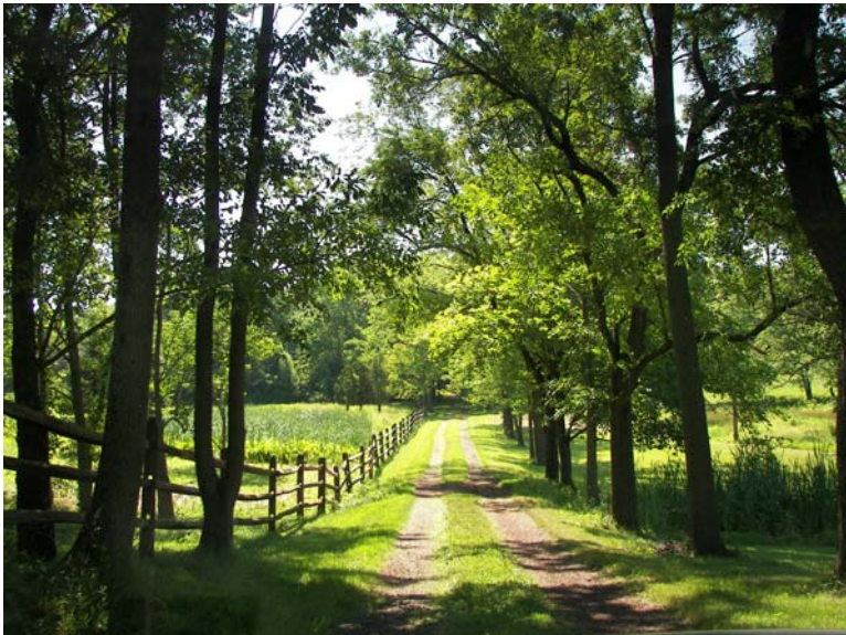
Lane leading to preserved property