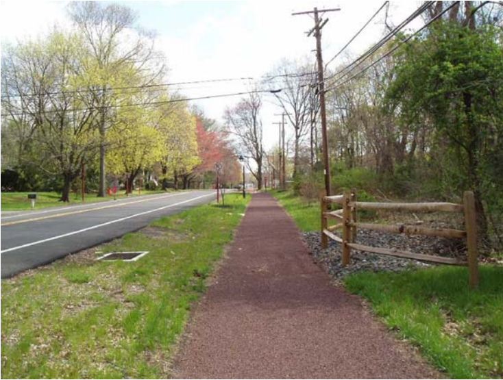
Photograph 6: Looking northeast from the new sidewalk along Washington Crossing Road at the stormwater drainage grate and improved area around the existing culvert conveying water under Washington Crossing Road and on to the preserved property.