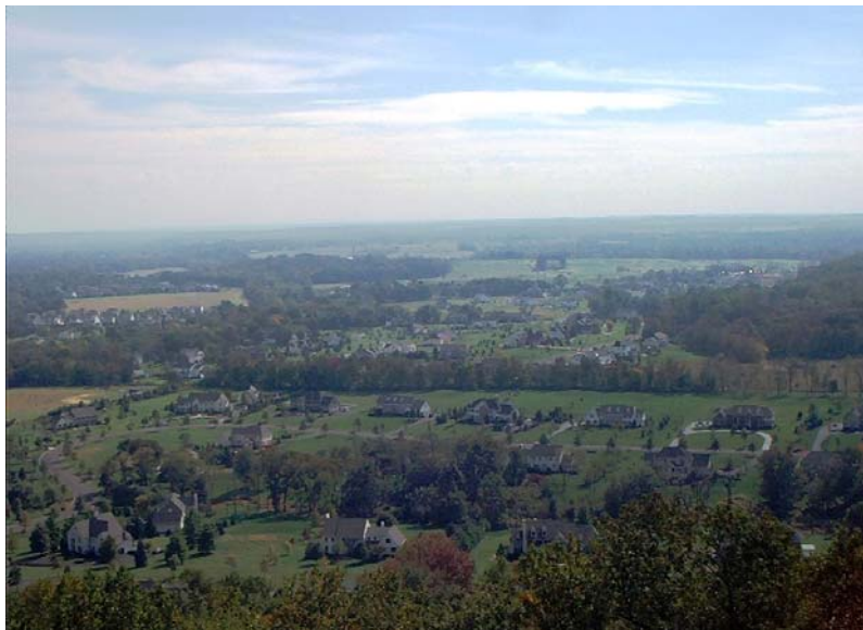
Former farmland viewed from Bowman's Tower

The acquisition of the farmland of the Floge property preserves one of the last open spaces between River Road and the Delaware Canal. The land between the canal and the river has also been preserved. The township's preservation of the Lehman, Buckman, and Rapuano tracts along Wrightstown Road has preserved long range vistas across the township into New Jersey. The agricultural views along the westerly side of Eagle Road were preserved with conservation easements on the Antrobus and Magill properties.