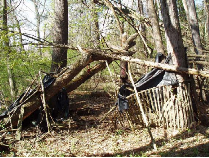
Photograph 3: Looking southwest at an old fort observed on the property.