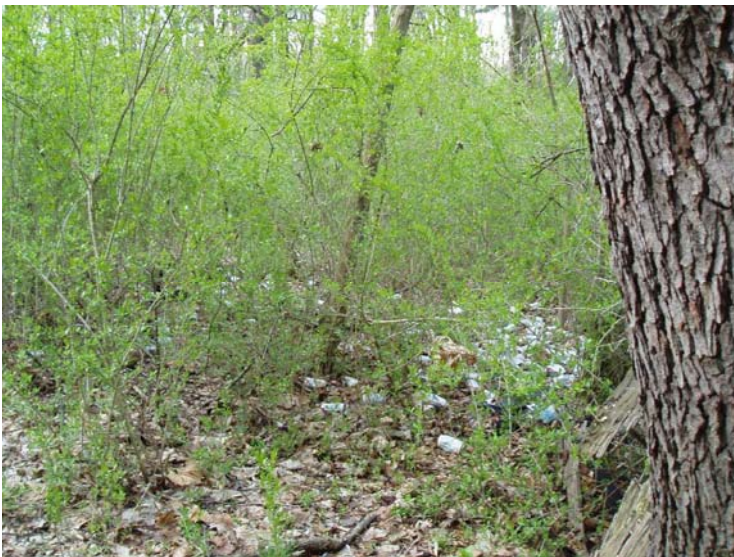
Photograph 5: Looking southwest at what appears to be an old party site with numerous aluminum beer cans remaining.